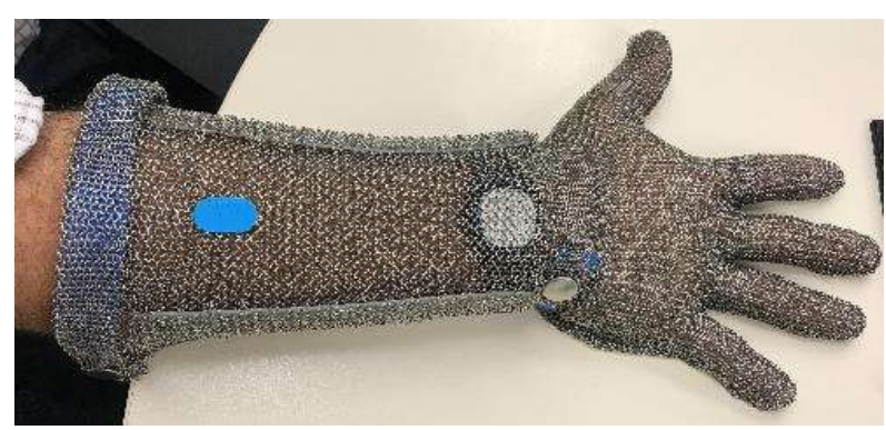
Figure 1: IIoT Meta sensor (Watch Device) worn under protective mesh glove.

Disclaimer: The information contained within this publication has been prepared by a third party commissioned by Australian Meat Processor Corporation Ltd (AMPC). It does not necessarily reflect the opinion or position of AMPC. Care is taken to ensure the accuracy of the information contained in this publication. However, AMPC cannot accept responsibility for the accuracy or completeness of the information or opinions contained in this publication, nor does it endorse or adopt the information contained in this report.