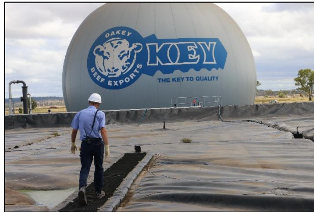
Walking on the CAL cover Image: NB Foods, Oakey