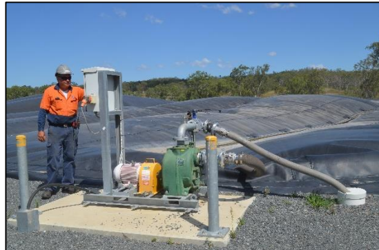
Turning on stormwater pump Image: Teys, Beenleigh