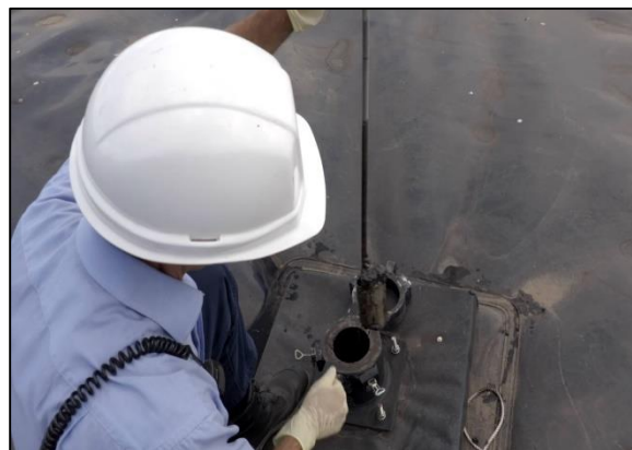
Taking a sample for a port