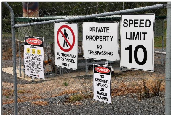
Exclusion signage

Safe operating practices are organized as Work Instructions specific to the needs of your plant. Always follow work instructions.