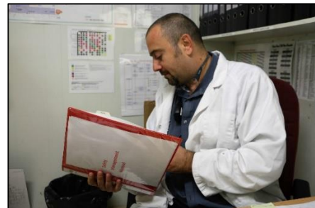
Ensure you know and follow your plants' Safety Management Plan

To ensure your own safety and the safety of others working on or near CALs and biogas trains ensure you know and follow your plants' Safety Management Plan. If you have any concerns always seek the advice of your supervisor.