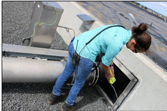
Checking for leaks in the CAL wall