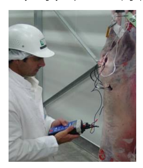
Figure 2. Standard pH measurement location.

Standard pH measurement location is found at the lumbar-sacral junction, overlaying fat is cut away so as to prevent fouling of the pH electrode (Fig 2).